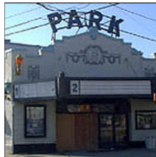
Historic former Park Cinema